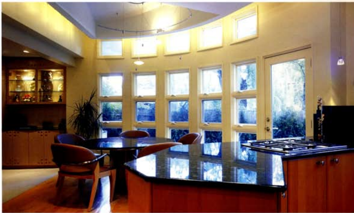
ABOVE TOP: The open nature of the design emphasizes the connection to the outdoors.