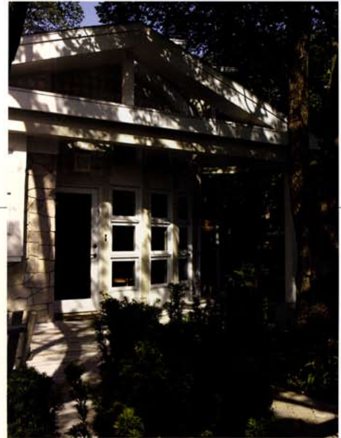
ABOVE: The use of geometric forms to create positive and negative space adds drama to the façade.

Other abstract academic exercises dealing with challenges totally unrelated to architecture, but with the need for meaningful solutions, underscored the foundation for his philosophy that architecture is the result of profound thought, intense research,