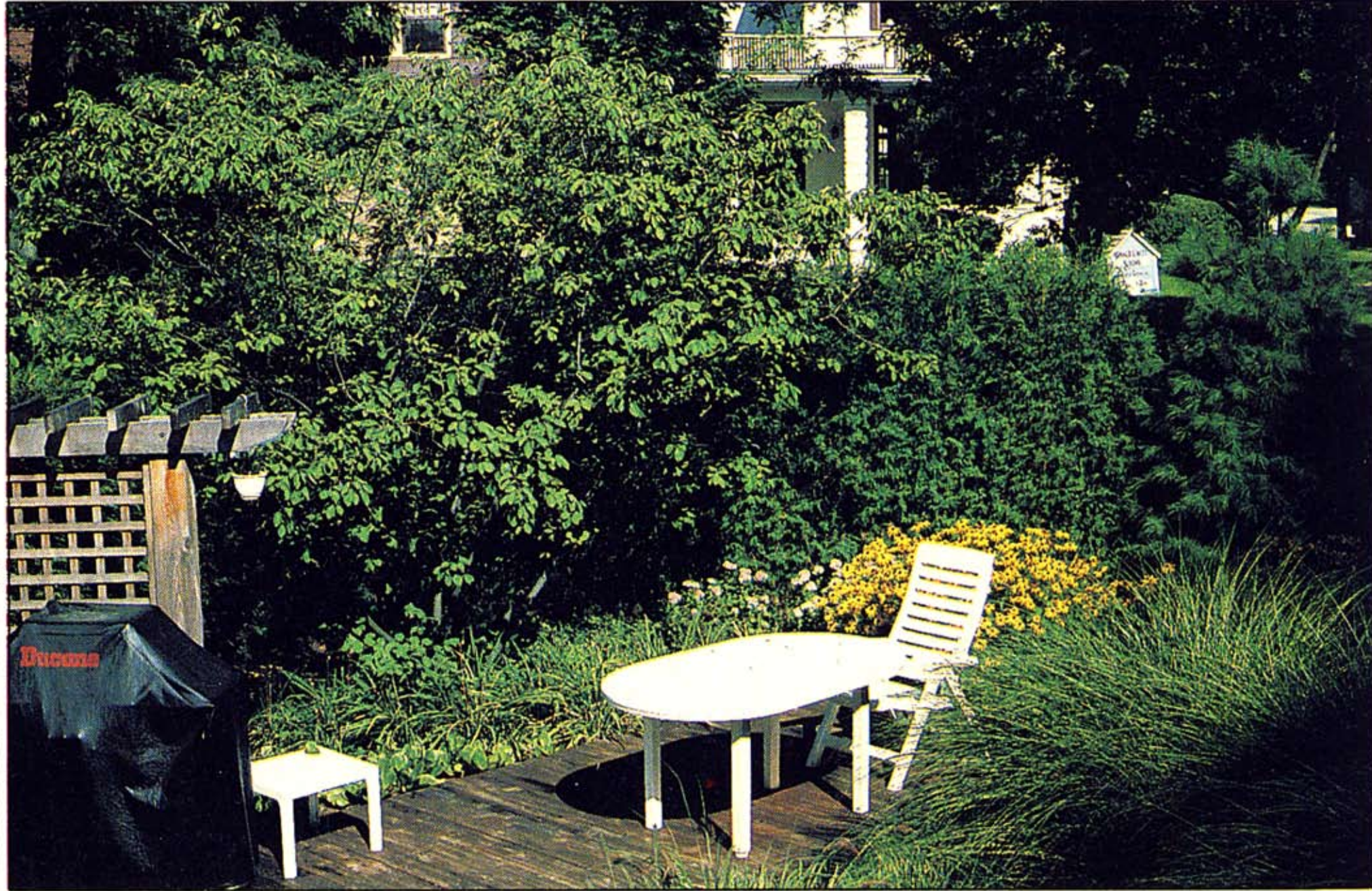
Shrubs and a lattice-like fence (at right) can be an effective privacy screen on the property line.